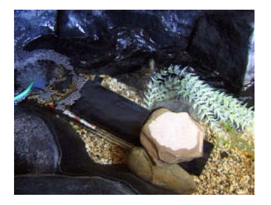
Pond with Fluval model 4 canister filter installed

All text & images Ó Chelonian Educational Resources Ltd., 2001