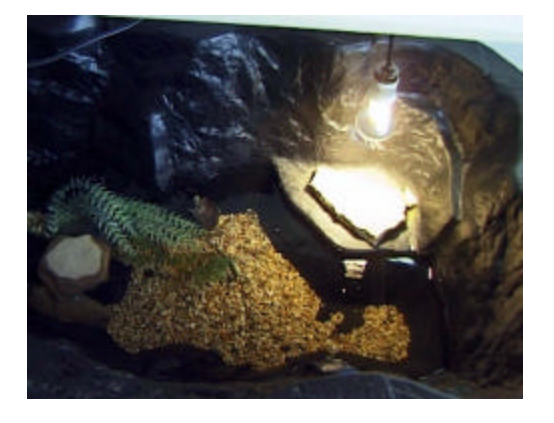
Pond basking stone area with overhead UV-B Heat lamp.

We hope that these guidelines have removed any hesitancy you may have had to create your own indoor pond and that you and your turtles will soon be enjoying the many benefits they provide.